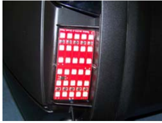
Picture # 11